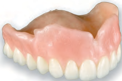
DAL UNIBASE WITH VITAPAN® TEETH