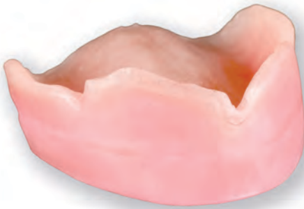
DAL UNIBASE WITH WAX OCCLUSAL RIM