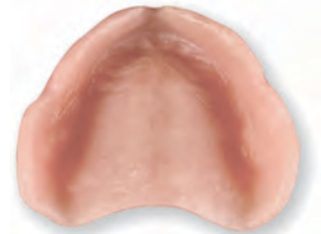
LUCITONE HIPA PROCESSED BASE

This unique technique provides you with a permanent processed denture base that is used throughout the entire appointment sequence. We produce a Lucitone HIPA acrylic base from your final impressions, creating a stable and tissue-bearing base for the wax occlusal rim or tracer (bite registration) and the setup (try-in) appointments. This processed base allows you to assess the borders of the denture base and to make modifications early in the fabrication process, rather than waiting until the delivery appointment. A new base should be fabricated if the Unibase lacks proper fit or retention. If a new base is necessary, simply take a wash impression inside the Unibase and return for processing of a new Unibase. Please indicate proper labial lip support (thickness), incisal edge position, midline, cuspid position and high smile line when recording the bite registration.