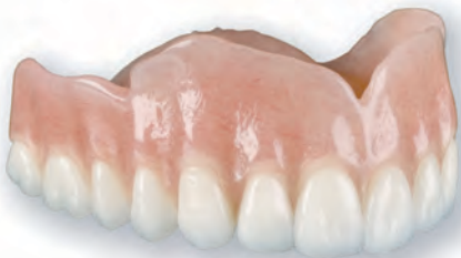
PREMIUM DENTURE WITH VITAPAN TEETH