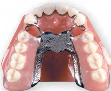
COMBINATION-PRECISION CROWNS WITH ERA® PARTIAL DENTURE